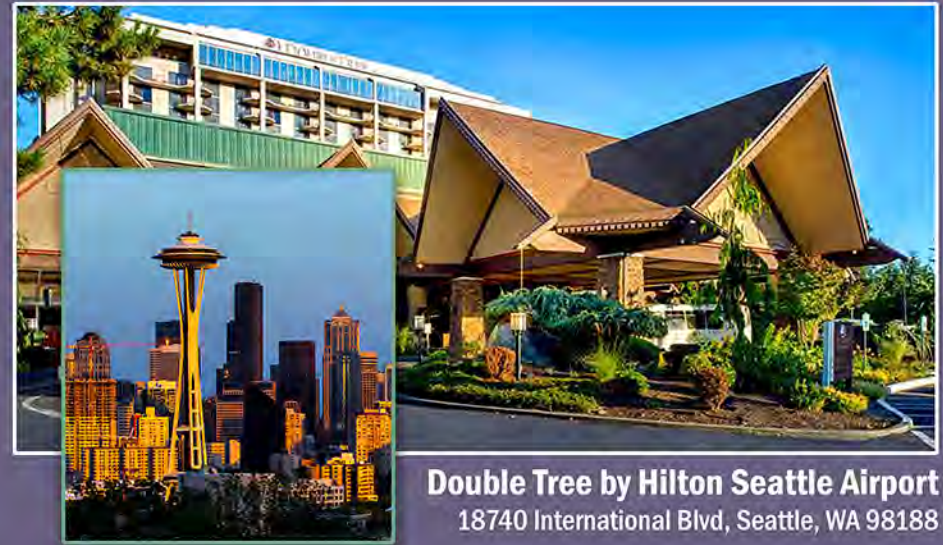
Double Tree by Hilton Seattle Airport 18740 International Blvd, Seattle, WA 98188

Date: _____ Amount: _____ Received by: _____